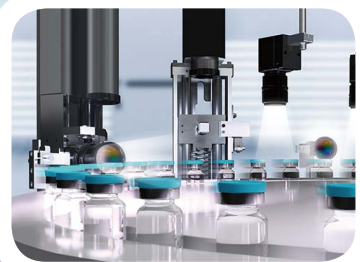
▲ Auto Optical Inspection