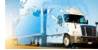
TRANSPORT & LOGISTICS