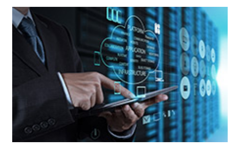
Internet of Things