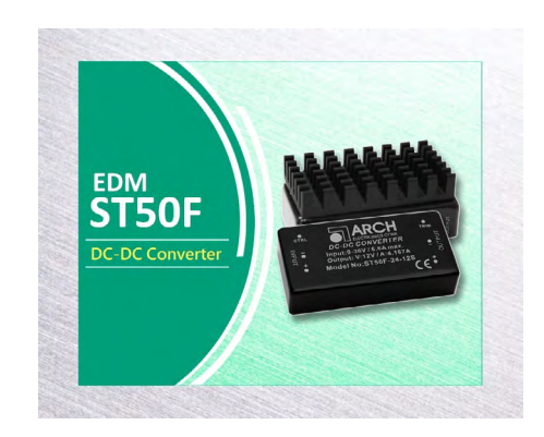
Up to 91%, 50W isolated DC-DC converter