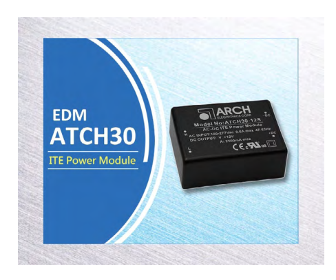
30W AC/DC Module 90-305 VAC input; -40°C to +85°C