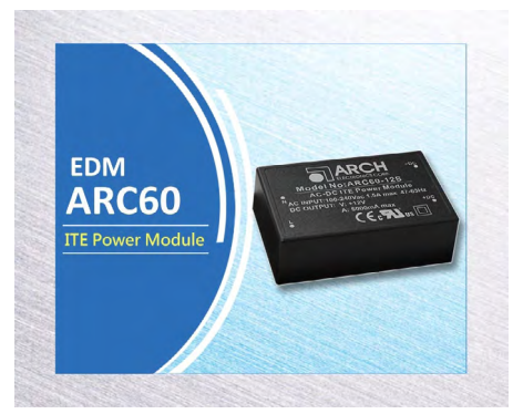
Fully encapsulated AC/DC Power for Automation, Industry, ...