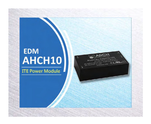
10W AC/DC power, enhanced mains input conditions