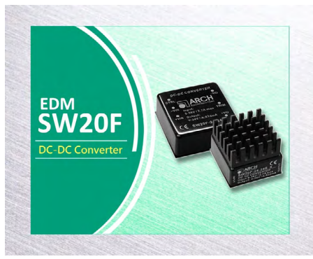
Wide input 20W DC/DC converters in just 1.0" x 1.0" x 0.45"