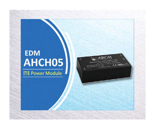
Cost effective 5W AC/DC power offers extended temperature range with universal input range