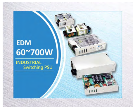
60-700W PSU Open Frame / U-backet / Enclosed