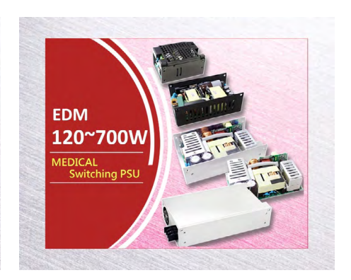
120-700W Medical PSU Ultra Compact Size