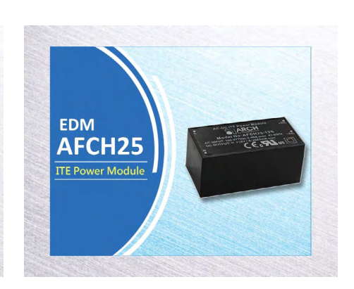
AC/DC ITE Power Module 25 Watt