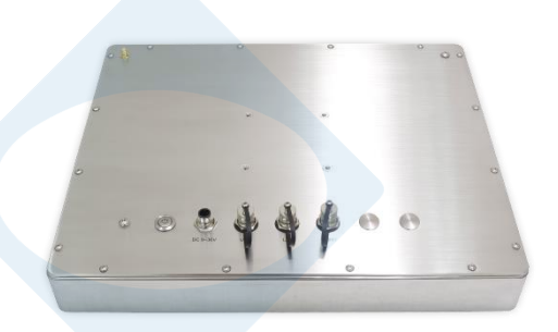
Wide Range DC 9~36V Power Input

DC 9~36V wide range power input brings the advantage of flexibility and reliability in case the voltage of equipment is different or unstable.